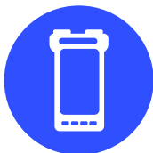
Event - Access Control