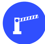
PARCs - Access Control