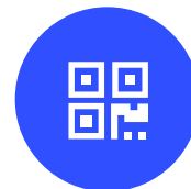
PARCs - Gated Payments