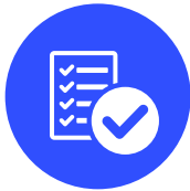
Back Office & Reporting